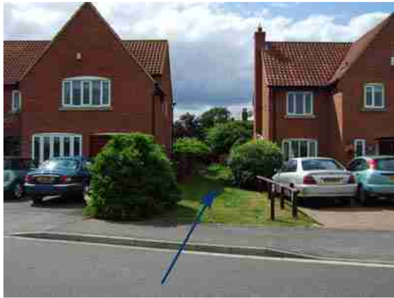
The entrance to Trent Ford Road as seen from Dickinson Way .