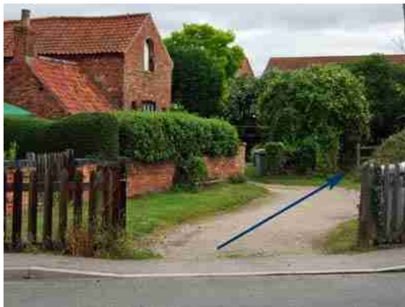
The route of Trent Ford Road leading through to Dickinson Way , the lake and the recently opened riverside walk.