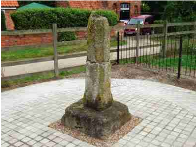
The historic Muskham Cross monument with Trent Ford Road foreground and The Shades background.