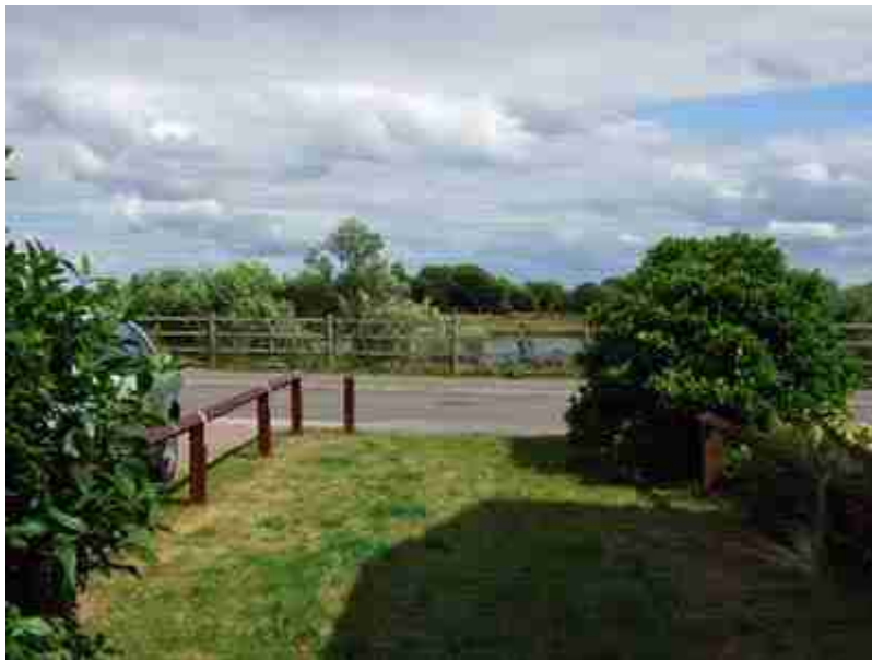
A view across the lake with the River Trent beyond as seen from the Dickinson Way end of Trent Ford Road .

Turning left out of Trent Ford Road and crossing the road leads to the path that goes around the lake and a pleasant riverside walk to the south end of the village, the Ferry pub, St Wilfrid's church and South Muskham village beyond.